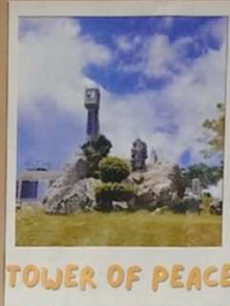
TOWER OF PEACE